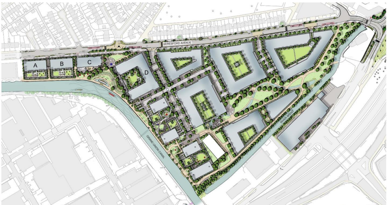
Grand Union Masterplan